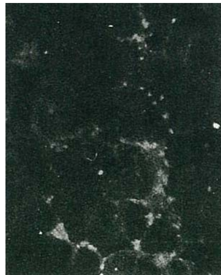
Fig.2 Detection of HCV NS5b protein by immunofluorescence antibody staining. Chimp liver cells were infected with recombinant vaccinia virus containing a HCV genome cDNA. After incubation for 48 hr, the cells were fixed with acetone and HCV NS5b protein was detected by indirect immunofluorescence staining using this antibody.